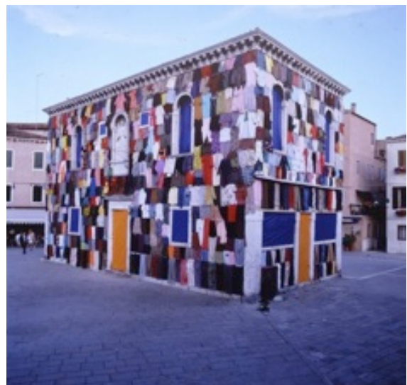
「The Dressed House」, 1999 Venice Biennale