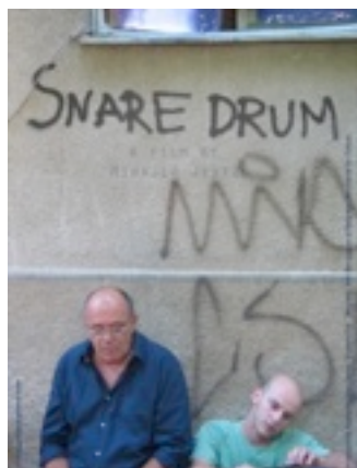
「snare drum」 (fiction, 15min, 2008)