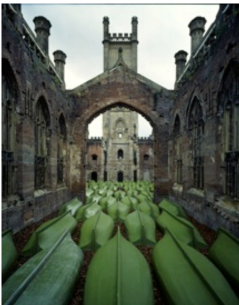
「56 Boats」, 2006 Liverpool Biennial, UK