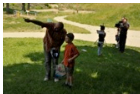
video shooting session for the fiction 「Gagarin and Me」 (Serbia)